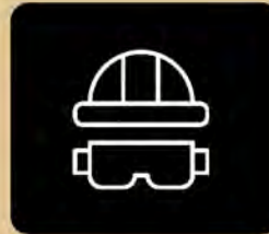
NAC Safety Symposium