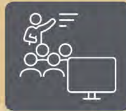
In-Person and Online Presentations