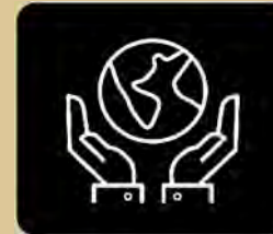
Global Leadership Meeting