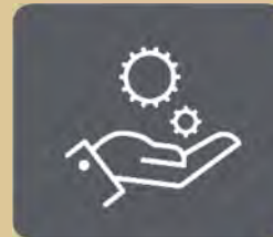
Lean Group Meeting