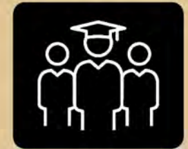
CIB Doctoral School