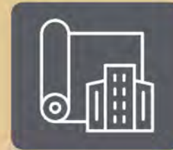
Open Building Workshop